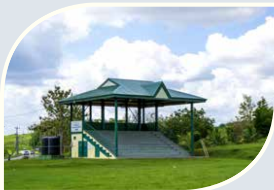
Aussie Pavillion located at Papourie Road Monkey Town