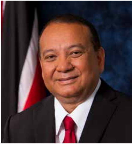
The Hon. Mr. Franklin Khan, Minister of Rural Development and Local Government