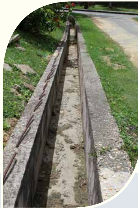
Mohan Trace Box Drain