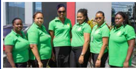
LITTER PREVENTION WARDENS