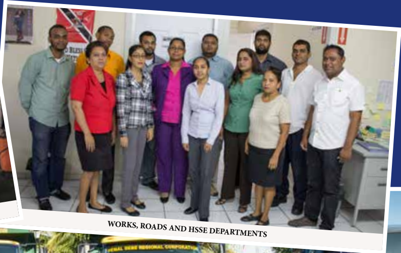
WORKS, ROADS AND HSSE DEPARTMENTS