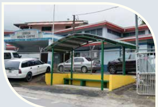
Bus Shed located near the Lengua Health Centre