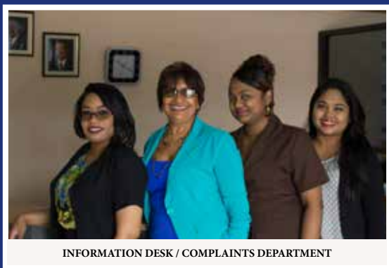
INFORMATION DESK / COMPLAINTS DEPARTMENT