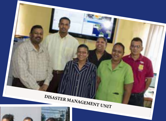
DISASTER MANAGEMENT UNIT