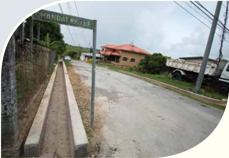
Box Drains at Chandai Avenue