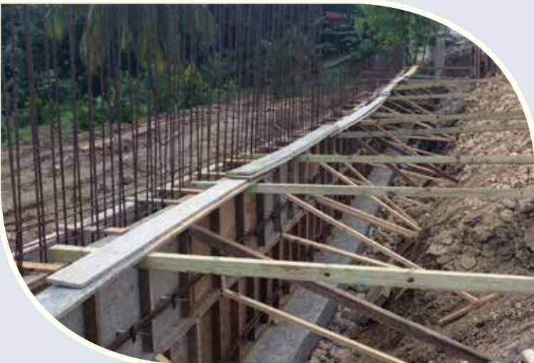
Box Drains at Chandai Avenue