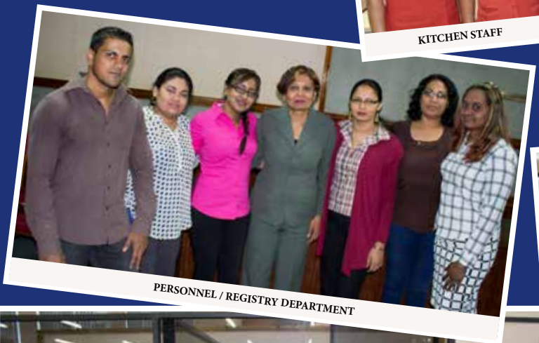
PERSONNEL / REGISTRY DEPARTMENT