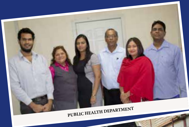
PUBLIC HEALTH DEPARTMENT