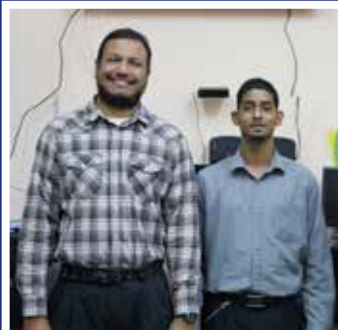
I.T. SUPPORT STAFF