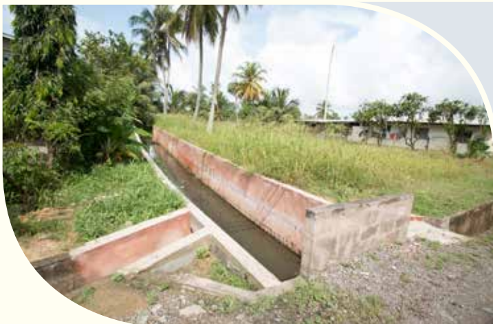
Rochard Road Box Drain and Box Culvert