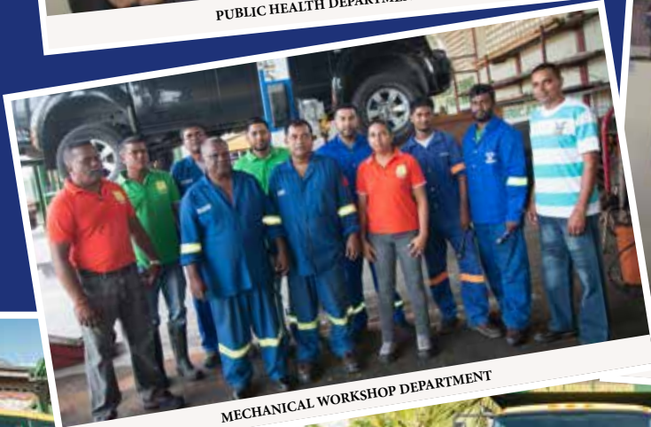
MECHANICAL WORKSHOP DEPARTMENT