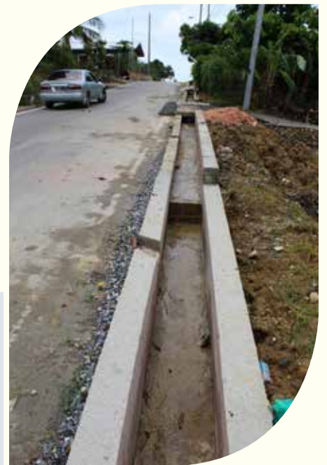
Satnarine Trace Box Drain