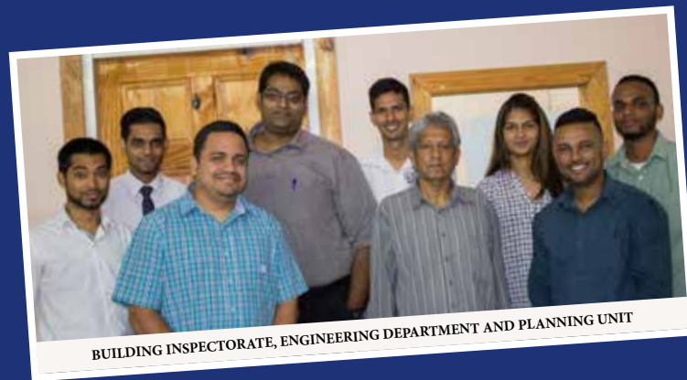
BUILDING INSPECTORATE, ENGINEERING DEPARTMENT AND PLANNING UNIT